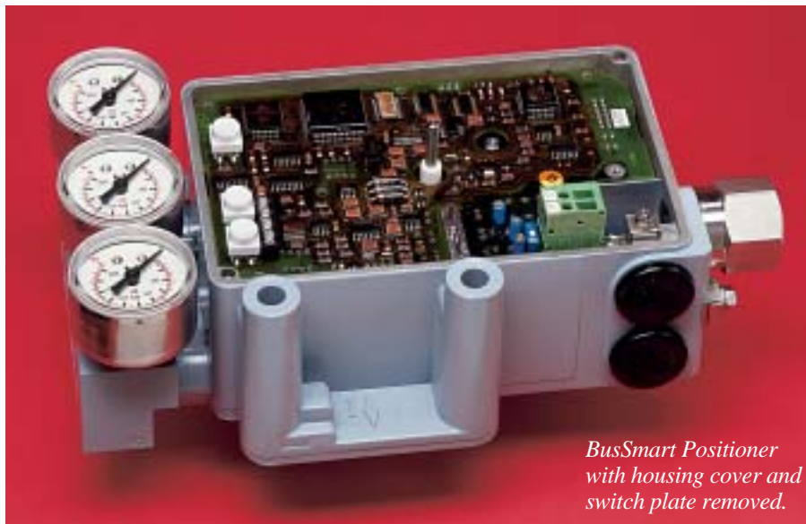
BusSmart Positioner with housing cover and switch plate removed.

All Series 67 positioner enclosures are purged and waterproof to NEMA 4, 4x (IP65) standards. Explosion proof enclosures are available. The positioners are FM, CSA, CE and CENELEC approved. With a low air consumption of 1.9 SCFH at 90 psi, Bray's electro-pneumatic positioners are very efficient to operate. The positioners respond to a 4-20 mA input command signal and each positioner has a mechanical travel position indicator. Modular accessories offered include a gauge manifold for single and double acting models, a booster relay and inductive limit switches.