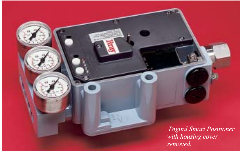
Digital Smart Positioner with housing cover removed.