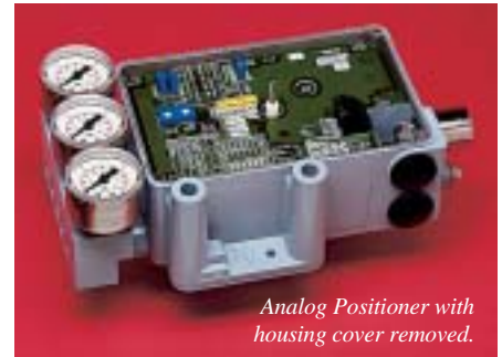
Analog Positioner with housing cover removed.

Other features include travel limit stops, power cut off, split range and characteristic curve functions.