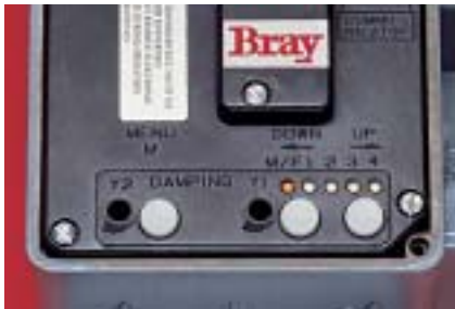
AutoStart Push Button Configuration

Both the BusSmart Positioner and the Digital Positioner feature AutoStart with self-calibration and configuration by means of local push buttons and LEDs. Complicated potentiometer and switch settings are eliminated – configuration is simply a matter of pushing buttons. AutoStart automatically determines the mechanical travel limit stops, records the parameters and continually optimizes control behaviors and travel times bidirectionally by applying and analyzing setpoint jumps. Control behavior parameters are gain, damping and delay on positioning time. These parameters are automatically set for open and close differences and are user adjustable. The settings are then stored in non-volatile memory to prevent loss due to power failure. After performing the AutoStart procedure, the positioner is ready for operation.